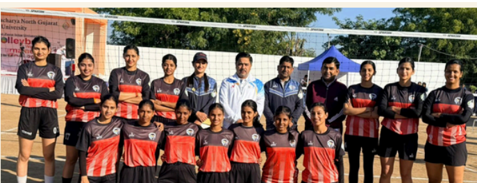
Women's Volleyball Team