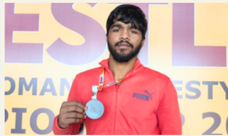
Bronze Medalist in Wrestling (AIU)