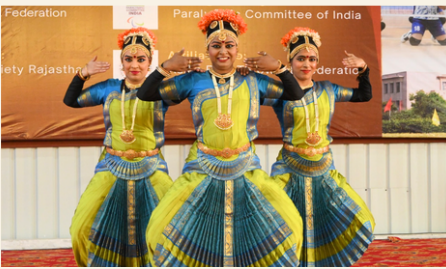
Special Performance by "We Are One" Group

At Singhania University, education goes beyond textbooks and classrooms. A vibrant campus environment enriched with sports, cultural engagements, advanced laboratories, moot court and industry exposure helps students build confidence and strengthen practical skills.