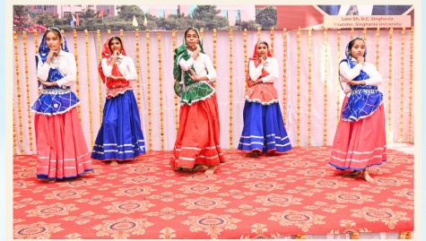
Haryanvi Folk Dance Performance (Singhania School's Students)