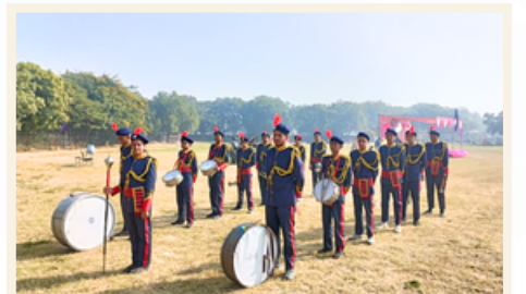
Singhania School Band