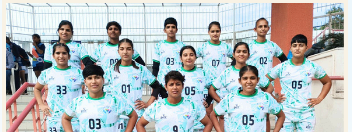
Women's Kabaddi Team