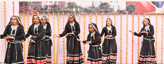
Kalbelia Folk Dance Performance (Singhania School Students)