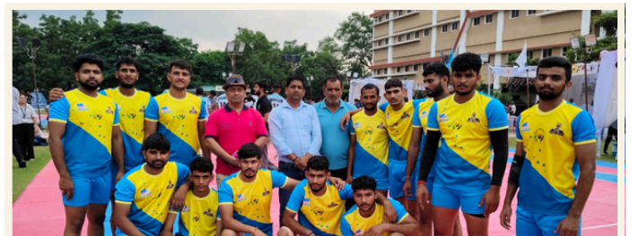
Men's Kabaddi Team