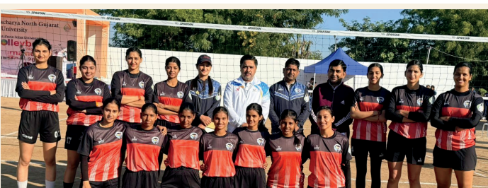
Women's Volleyball Team