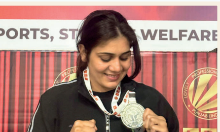
Silver Medalist in Boxing (AIU)