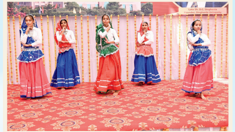
Haryanvi Folk Dance Performance (Singhania School's Students)