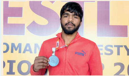
Bronze Medalist in Wrestling (AIU)