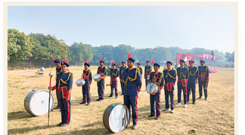
Singhania School Band