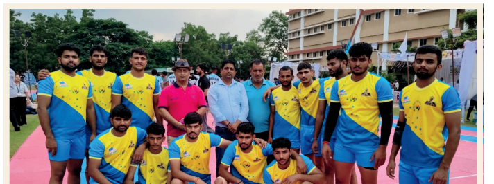
Men's Kabaddi Team