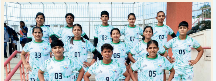
Women's Kabaddi Team