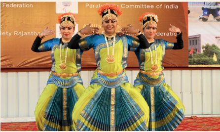
Special Performance by "We Are One" Group

At Singhania University, education goes beyond textbooks and classrooms. A vibrant campus environment enriched with sports, cultural engagements, advanced laboratories, moot court and industry exposure helps students build confidence and strengthen practical skills.