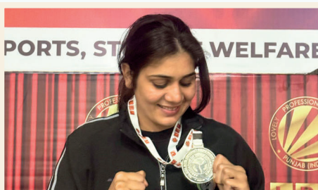
Silver Medalist in Boxing (AIU)