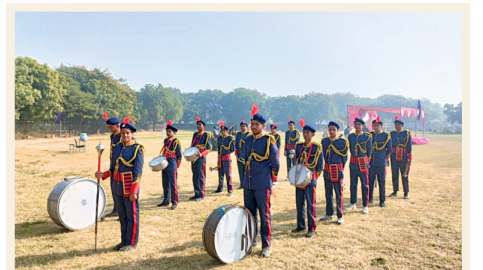
Singhania School Band